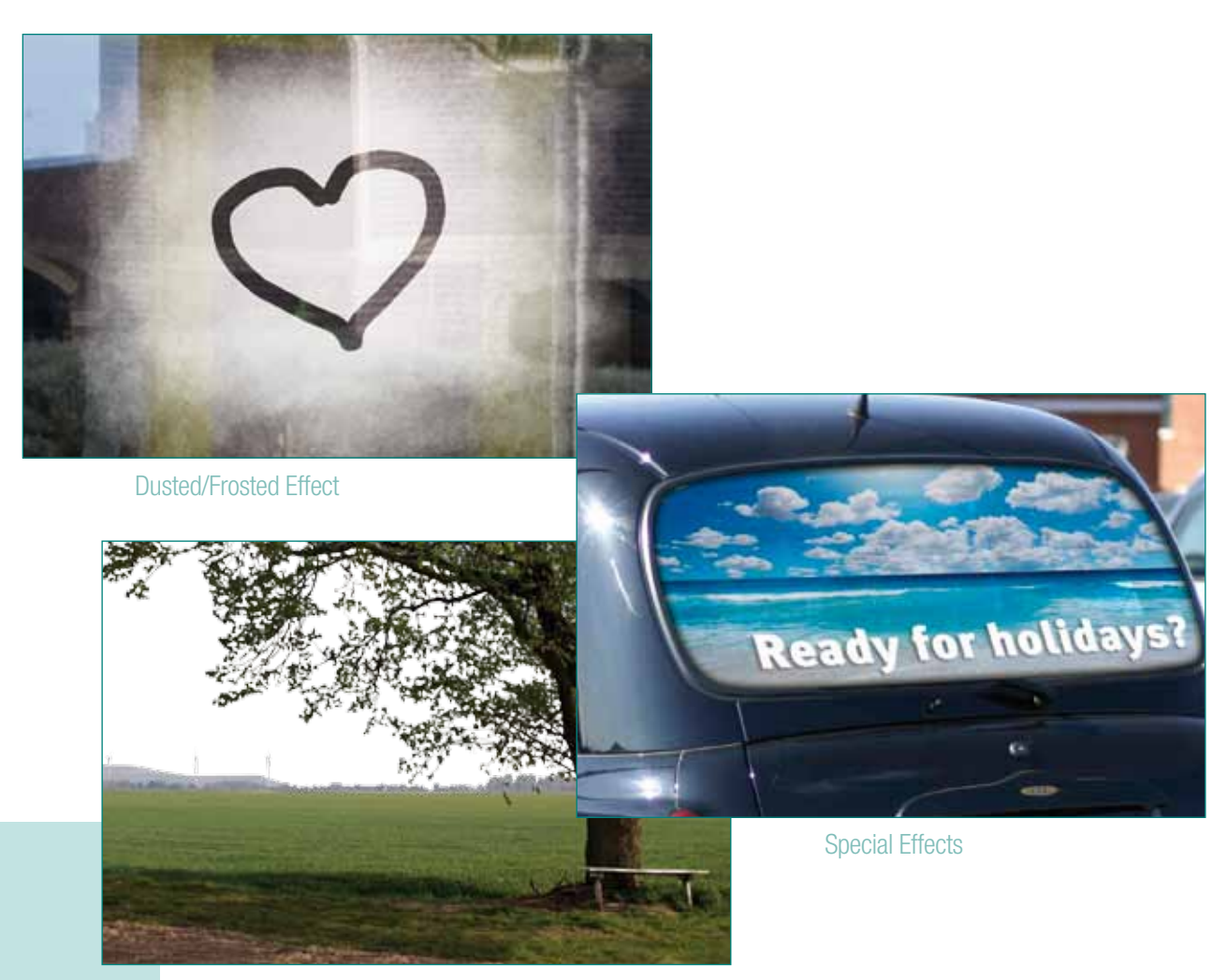
No Contour Cutting